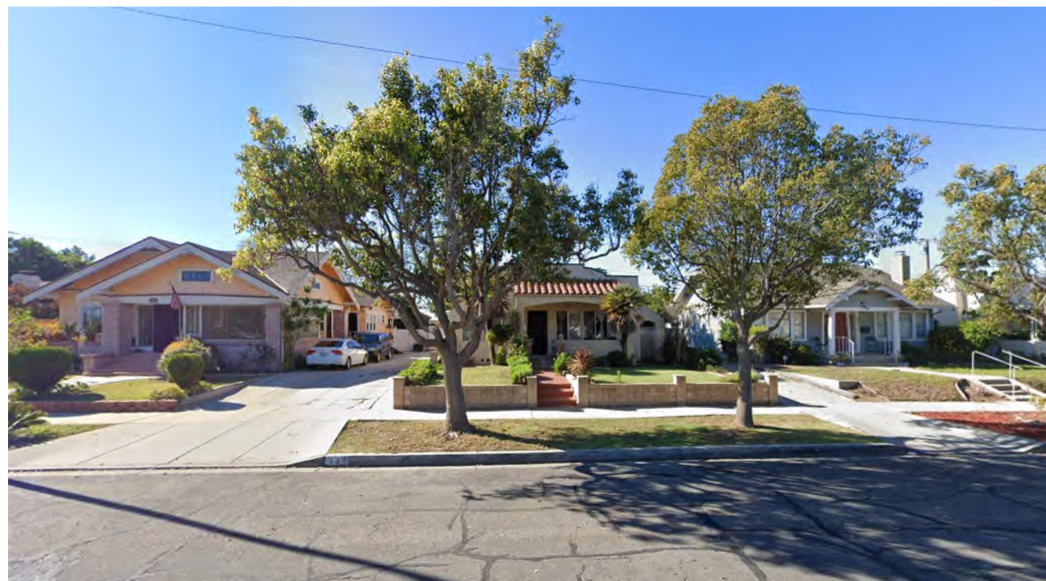
④ Properties West of Site- Street View