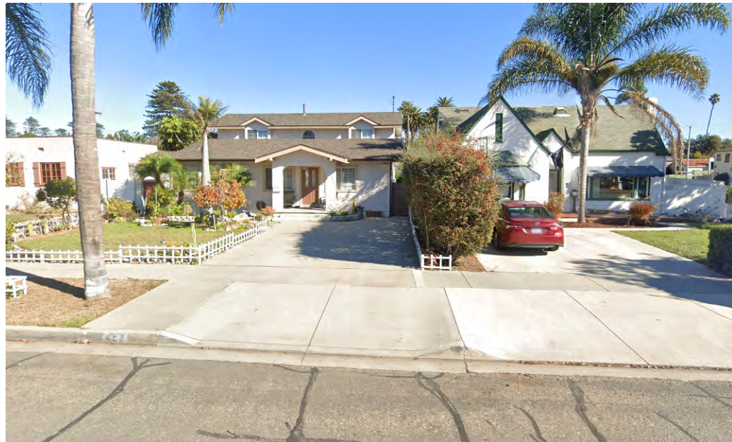
③ Site South - Street View