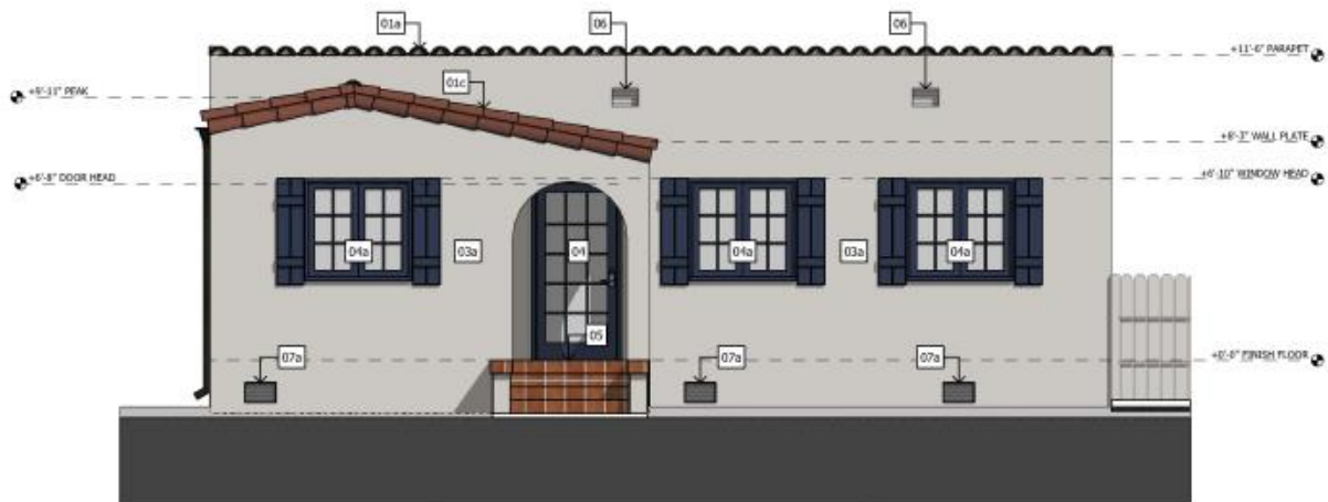
Figure 3 – Proposed Primary Elevation