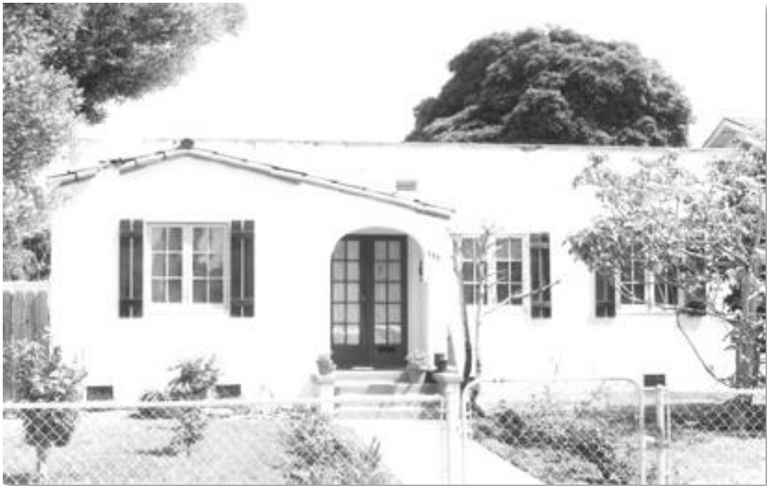
Figure 1 – Subject Property, 1981