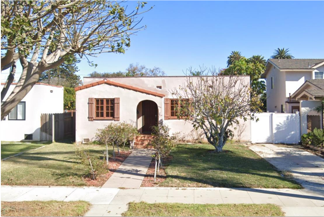
Figure 2 – Street View of Existing Property, 2022