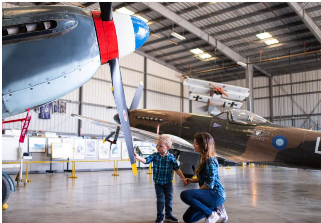
Figure 4 – Commemorative Air Force Southern California Wing