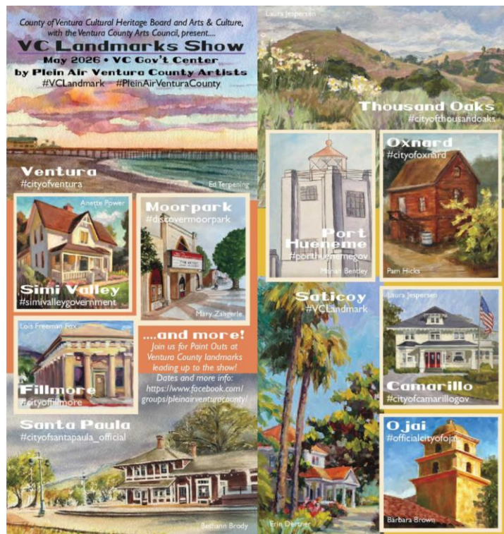
Figure 1 – Art Show Promotional Flyer