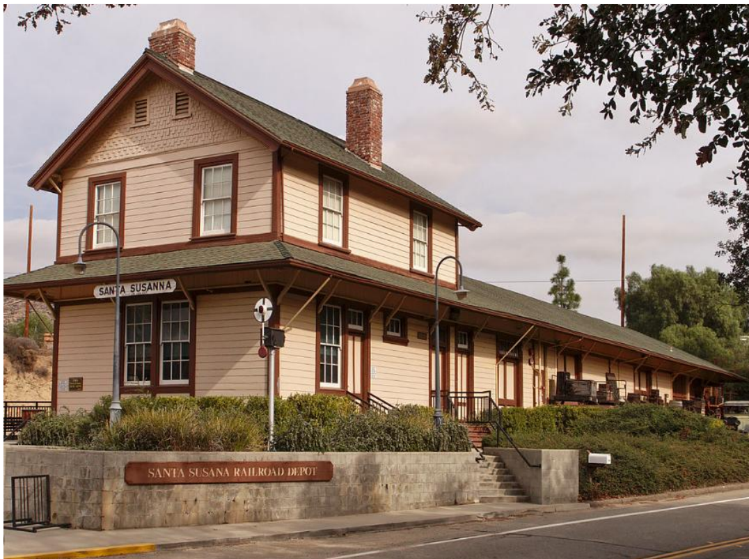
Figure 3 – Santa Susana Railroad Depot and Museum