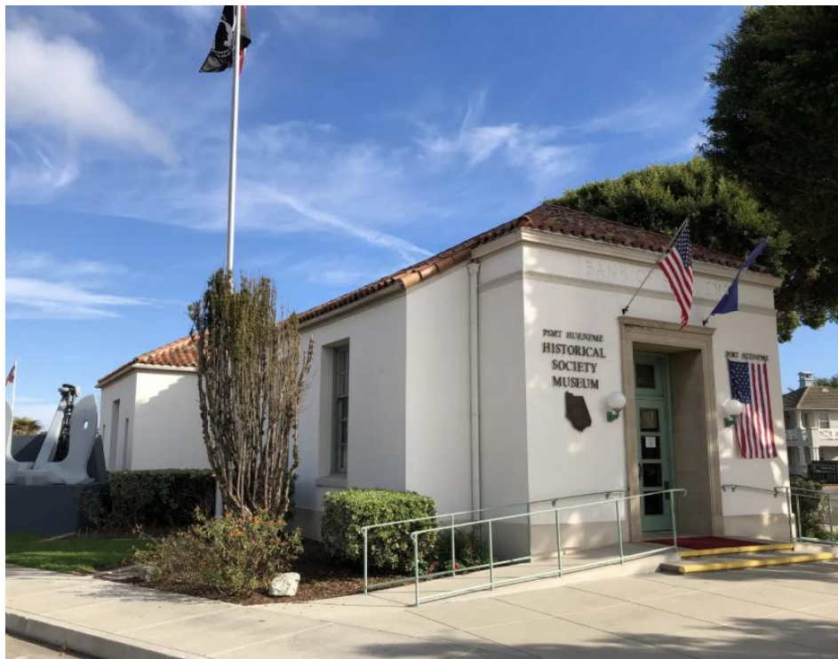
Figure 5 – City of Port Hueneme Historical Museum