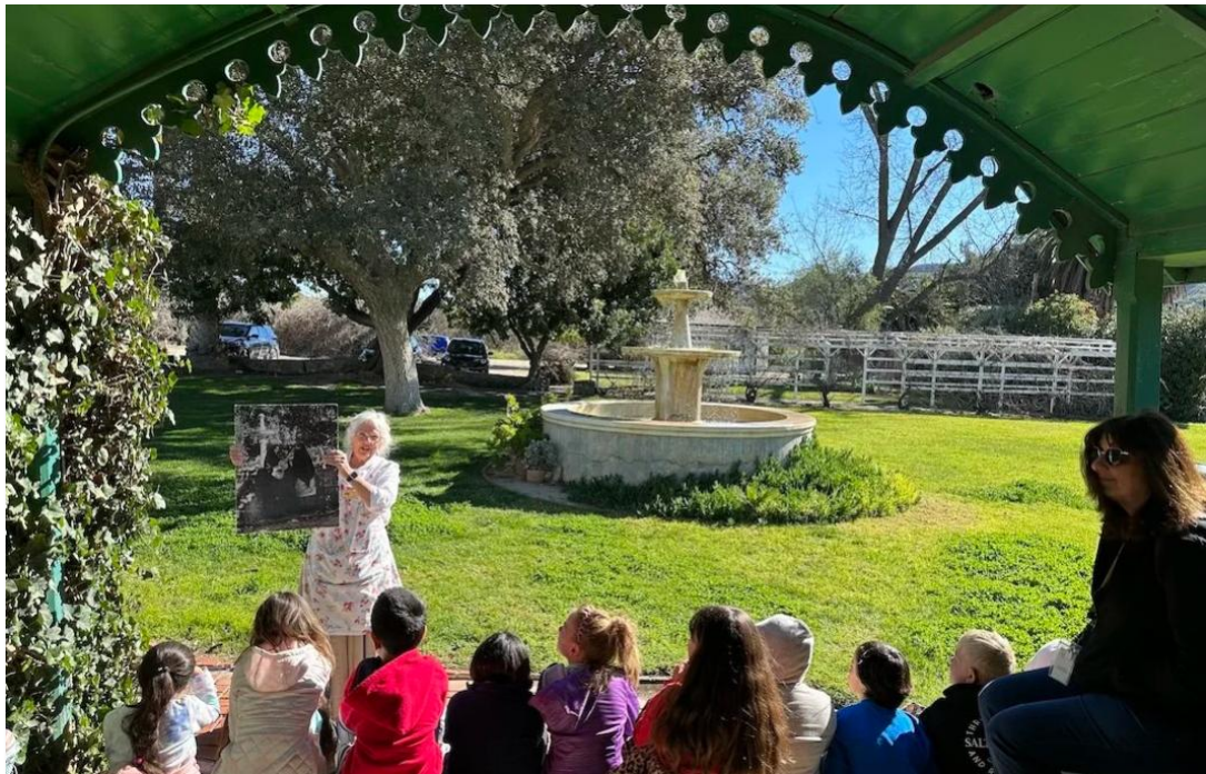
Figure 6 – School Field Trip at Rancho Camulos Museum

museum offers guided tours, school field trips, living history events, cultural celebrations, hands-on demonstrations, and programs that highlight the site’s agricultural, Californio, and early American periods. Its dedication to sharing the diverse stories of the families and communities who lived and worked at Rancho Camulos, combined with active volunteer engagement and thoughtful interpretation, ensures that this landmark remains a vital educational resource and a vibrant link to Ventura County’s earliest history. Figure 6 shows some of the educational programming for students at the Rancho Camulos Museum.