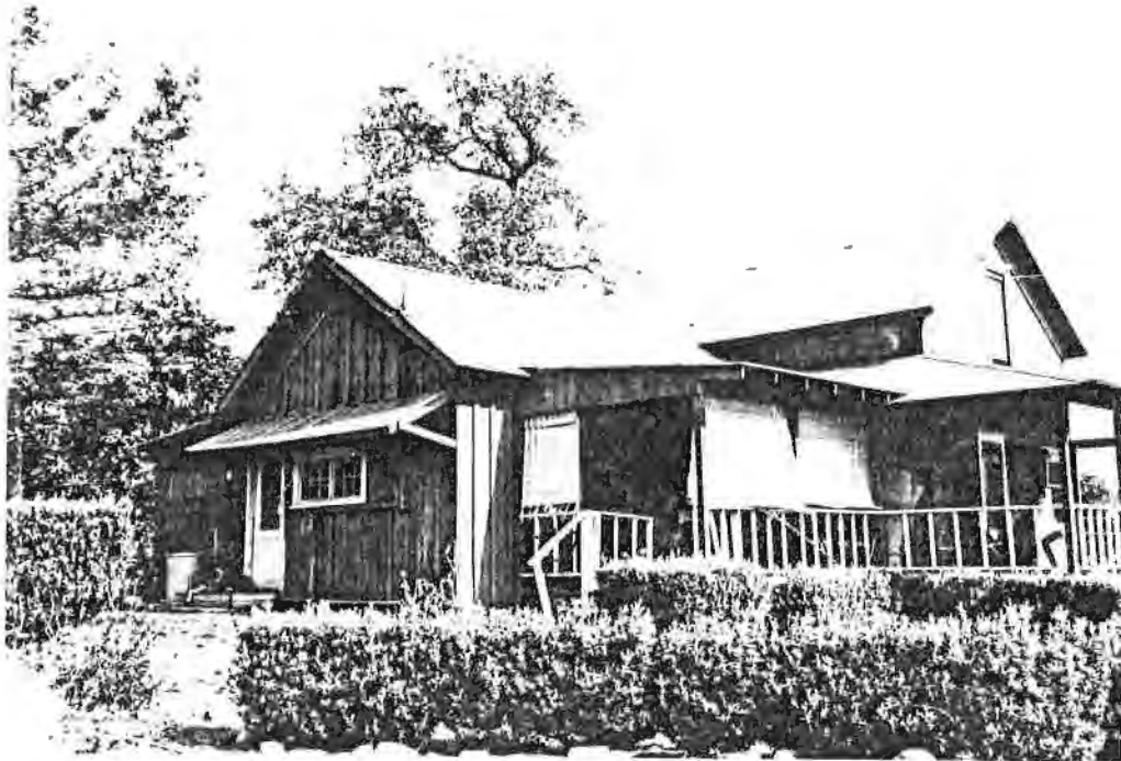
1382 Orange Road

This one and one-half story residence is currently used as a foreman's house. It had possibly been moved onto the ranch and dates from the 1890s. The house was basically rectangular with a medium high pitched gable roof with a lower gabled wing extending from the side of the house creating an L-shape. Siding on the main portion of the house is wide shiplap and windows have some Victorian period detail with shelf moulding and plain wood cornice. The side wing has board and batten siding and multi-paned windows. A hip roof with exposed rafters extends over the porch supported by square posts. The house is on a raised wood foundation.