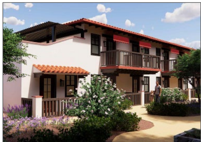
Rendering of the 49-unit Camino de Salud residential development; Architectural Rendering by RJC Inc.

The Camino de Salud supportive housing project is a 49-unit development located within the planning area of the Ojai Valley Area Plan. As a 100 percent affordable supportive housing project, the application qualified for a ministerial, streamlined review utilizing AB 2162 and SB 35. The project includes a new supportive housing complex consisting of 48 single room occupancy (studio) units, one 2-bedroom manager’s unit, two parking lots, landscaping, and a resident community garden. Supportive services offered on-site include, but are not limited to, medical, dental, and psychiatric care, benefits advocacy, housing retention training, women’s health, and jobs training.