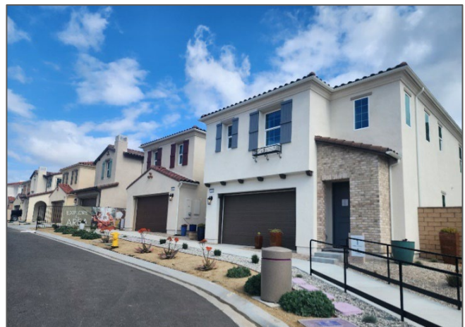
Photo of single-family dwellings constructed as part of Phase II of the Anacapa Canyon Development

Permits for construction of the development were provided by the California State University Deputy Building Official from 2021 through 2025. Construction for Anacapa Canyon began in November 2021, commencing with demolition and placement of utilities and streets. Several non-habitable structures were completed in 2023, which included the apartment leasing office, clubhouse, pool, and the fitness center complex. In December 2023, the first set of single-family homes were ready for occupancy. Thereafter throughout 2024, the first apartment building and senior apartments were constructed and leased to residents.