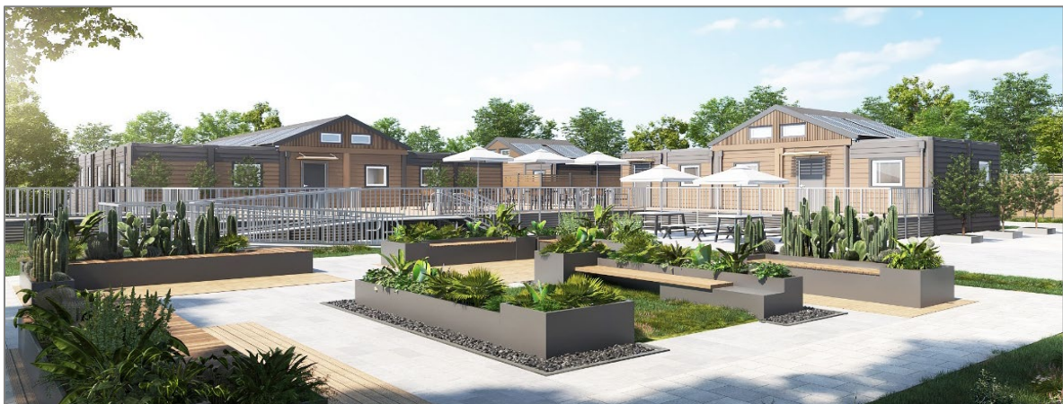
Rendering of the Homekey+ supportive housing project at Lewis Road; Photo credit: Life Ark

In the summer of 2025, the County served as the lead applicant to the State of California’s Homekey+ program for a supportive housing project on County-owned property located near Lewis Road in the unincorporated County, near the City of Camarillo. This