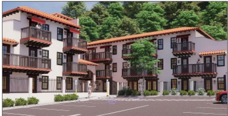
Photo of the proposed 49-unit Camino de Salud residential development; Photo credit: Cabrillo Economic Development Corporation (CEDC), Architectural Rendering by RJC Inc.

In addition, in response to the 2018 Woolsey Fire, which resulted in the loss of homes, the County received CDBG-Disaster Recovery Multifamily Housing Program funds to support the creation of new affordable housing. These funds have been prioritized for projects located near the areas where the fire burned to the extent possible. CDBG-Disaster Recovery Multifamily Housing Program funds were initially made available in response to the Woolsey Fire to a 78-unit permanent supportive housing project located in the City of Thousand Oaks. Due to the inability of this project to move forward, in June 2025 the County, in partnership with HCD, reallocated these funds, along with an additional investment of 2018 CDBG-Disaster Recovery Multifamily Housing Program funding into a 49-unit rental housing project, Camino de Salud, located in the unincorporated area of the County near the City of Ojai. Construction is expected to begin in the first quarter of 2026. Additional details on the Camino de Salud development are discussed in the 6 th Cycle Residential Development section.