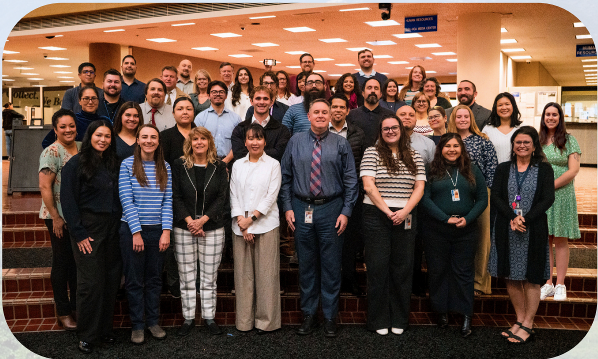
Ventura County Planning Division Staff, 2026

PREPARED BY: HOUSING AND STATE MANDATES POLICY SECTION