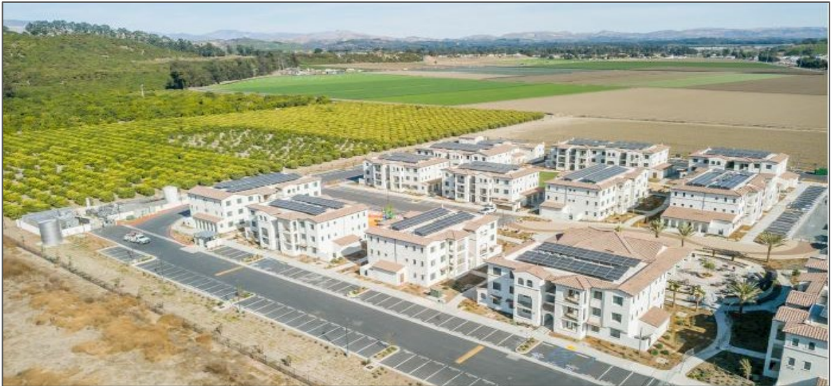
Aerial photo of the completed Somis Ranch Farmworker Housing Complex (2025); Photo credit: AMCAL California Affordable Communities

In February 2021, the Board approved a subdivision and discretionary permit application for Somis Ranch, a 360-unit farmworker housing complex in the unincorporated County near the City of Camarillo. The approved project included waivers for reduction of internal side-yard setbacks from 15 feet to 10 feet; incentives in the form of an increase in building lot coverage (from 5% to 25%); and a 100 percent affordability requirement, where all 360 units, except for manager units, must be rented to low- and very low-income residents. The units are required to be rented at affordable rents not greater than thirty percent (30%) of sixty percent (60%) of the monthly area median income (AMI) for low-income households, and not greater than thirty percent (30%) of fifty percent (50%) of the monthly AMI for very low-income households (including some units for extremely low-income households at rents not greater than thirty percent (30%) of thirty percent (30%) of the monthly AMI). The project consisted of two phases. Construction for Phase I for the first 200 units began in 2023 and certificates of occupancy were issued in 2024. Construction of Phase II for the remaining 160 units was completed in 2024, and all remaining certificates of occupancy were issued in 2025. This project is now complete.